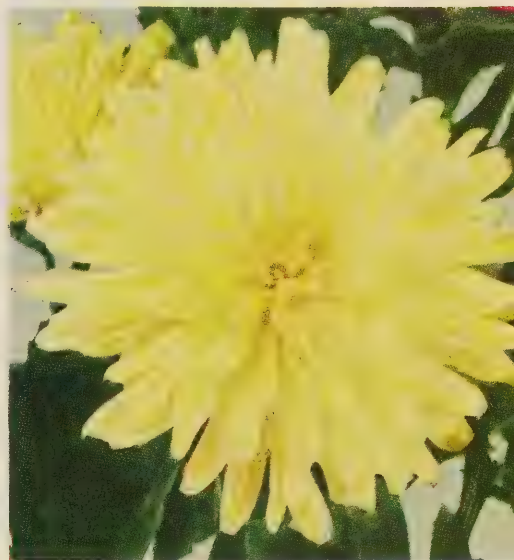
MARTIN'S YELLOW. 60c each; 3 for $1.50